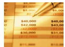
U.S. Energy Independence and What It Means For Investors